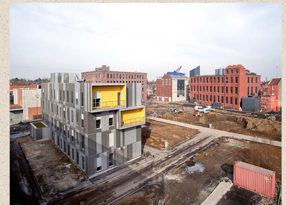
Development on a former industrial site (Quartier de l'Union - Lille Métropole - Secteur La Plaine Images)

After the design stage, comes the implementation stage, where the depollution engineering works includes the follow-up of the clean-up effort until the reception stage (réception des travaux) . These controls ensure that the implemented remedial measures are carried out as expected. They are recorded in the construction record ( dossier de récolement ) as well as the work completion report and the clean-up effort validation ARR.